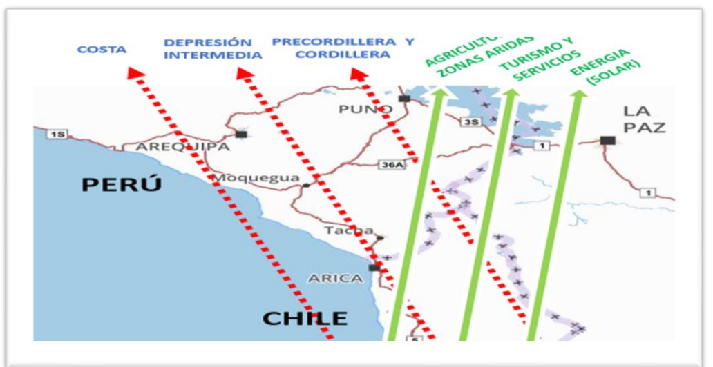
Figure 3. Interrelationship between geographical areas and economic sectors on the Peru-Chile border

It is interesting to observe in figure 3 that there is a high coincidence and interrelation between the geographical areas and the economic sectors of both regions.