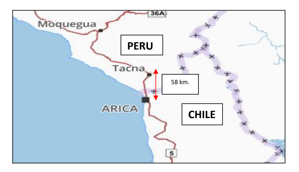
Figure 1. Map of the border area Tacna (Peru) - Arica (Chile)

The Arica and Parinacota Region - Chile and the Department of Tacna - Peru, are bordering regions that are located at a distance of approximately 58 km and maintain a dynamic and permanent contact.